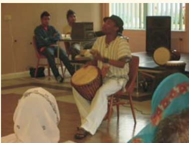
This African drummer, had the audience participating with his African tales through song