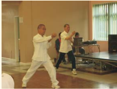
The Tia Chi was relaxing to watch and as usual the audience were encouraged to join in