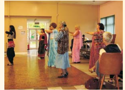
The staff and carers learning the art of Asian dancing