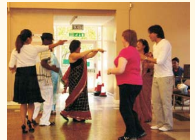
Everyone enjoyed the salsa lessons